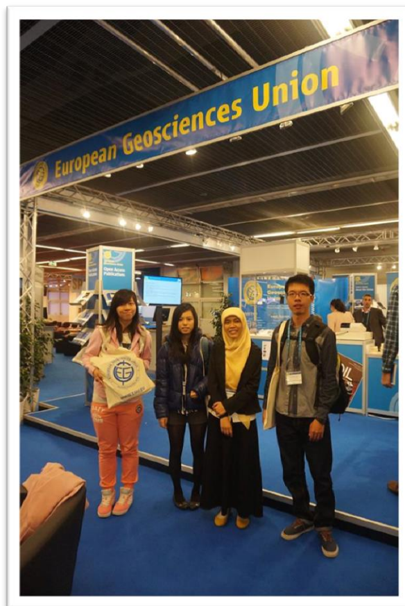
Picture was taken place in front of the EGU exhibition spot