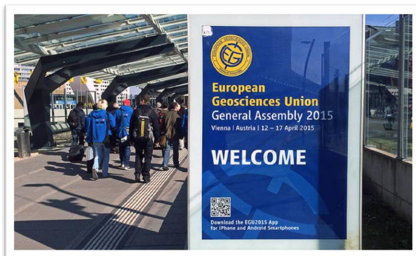
Vienna International Center